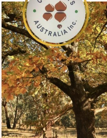
Quercus sub host