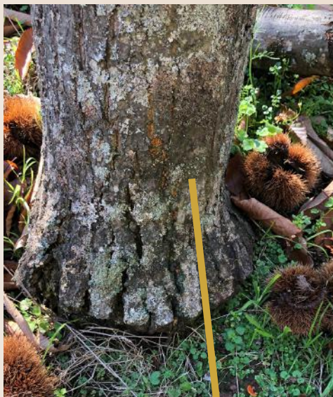
Chestnut blight on trunk